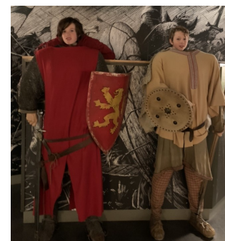
Greetings from Ireland