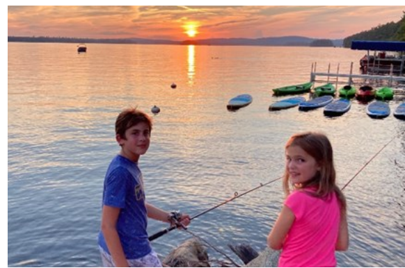
The Bleiman Family