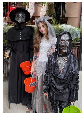
The Trokel Family enjoying Halloween

The Davison Family moved to Greece in 2020. All are hoping to return to camp in 2022!