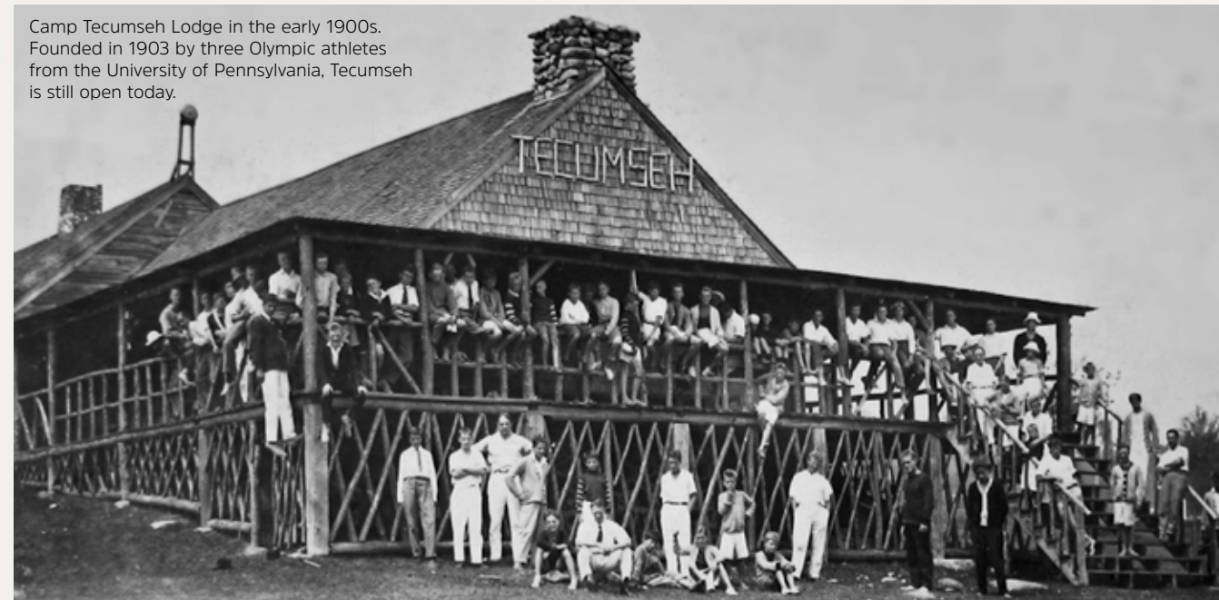
Camp Tecumseh Lodge in the early 1900s. Founded in 1903 by three Olympic athletes from the University of Pennsylvania, Tecumseh is still open today.

New Hampshire is best known as the first-in-the-nation state for the presidential primaries, but it is also the birthplace of America's first overnight summer camp. In 1881, Dartmouth College dropout Ernest Balch bought Squam Lake's Chocorua Island and created Camp Chocorua — aimed at the children of wealthy tourists visiting the White Mountains. His goal was to prevent as many rich kids as possible from becoming spoiled brats.