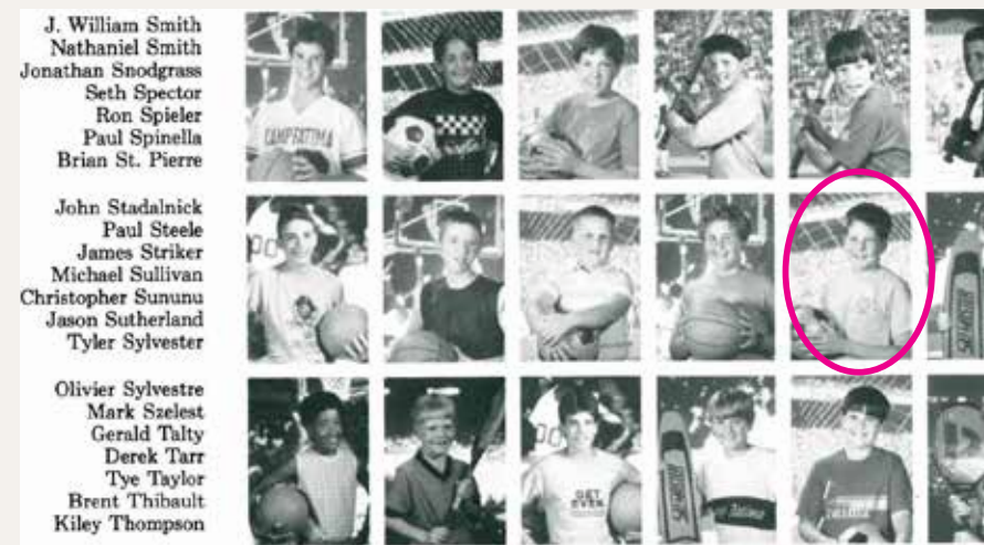
Gov. Chris Sununu in 1998 on his five-month Appalachian Trail hike and his Camp Fatima yearbook photo, which reveals his slightly spiked hair phase.